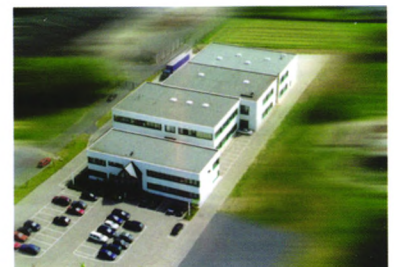
伊达高科焊接德国总部 EWM Mündersbach, Germany

EWM HIGHTEC WELDING (Kunshan) Ltd. 10 Yuanshan Road, Kunshan New & High-Tech Industry Development Zone, Kunshan, Jiangsu, 215300 P.R.China 伊达高科焊接(昆山)有限公司 江苏省昆山市昆山高新区圆山路10号 邮编: 215300 Phone: +86(0) 512 57867188 · Fax: +86(0)512 57867182 www.ewm.cn · info@ewm.cn