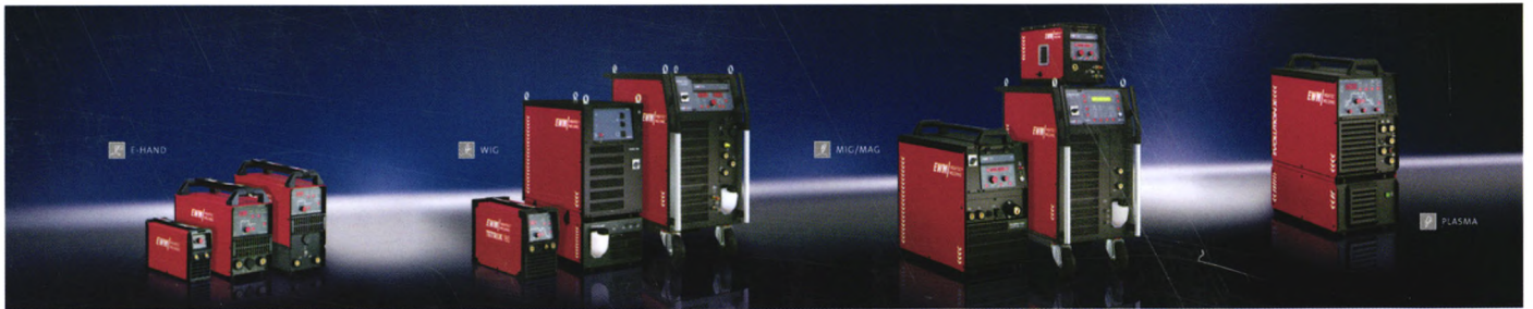
手弧焊 MMA welding

GERMAN STATE-OF-THE-ART TECHNOLOGY FOR CHINA AND ASIA