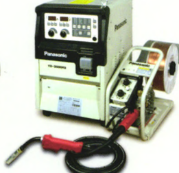
CO 2 /MAG焊机