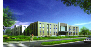
伊达高科焊接(昆山)有限公司 EWM Kunshan, China