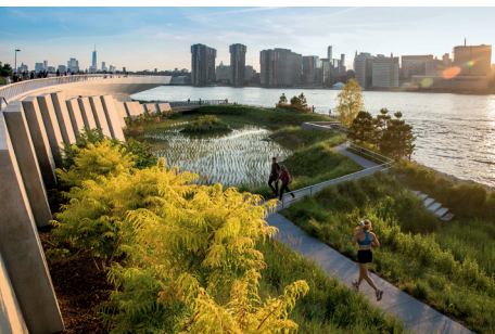
封面设计：北京多义景观规划设计事务所 Cover Design: Atelier DYJG