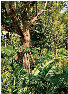
封面作品：艾尔斯卓越中心感官艺术花园 Cover Project: Els Sensory Arts Garden