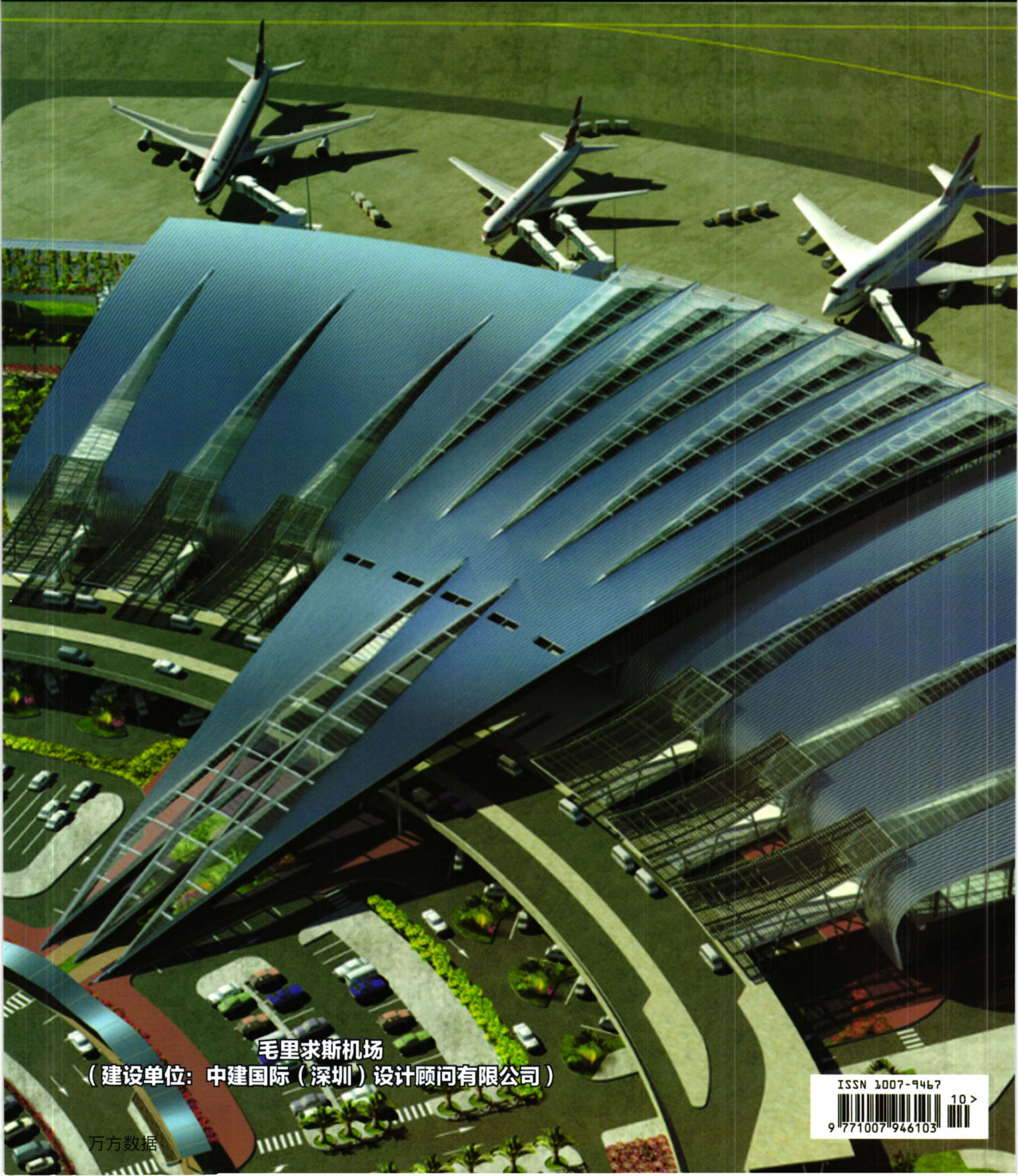
毛里求斯机场 (建设单位: 中建国际(深圳)设计顾问有限公司)

主办: 国家机械工业局工程建设中心 中国机械工业勘察设计协会 中国中元国际工程公司 CN 11-3914/TU 2013年第10期 总第306期