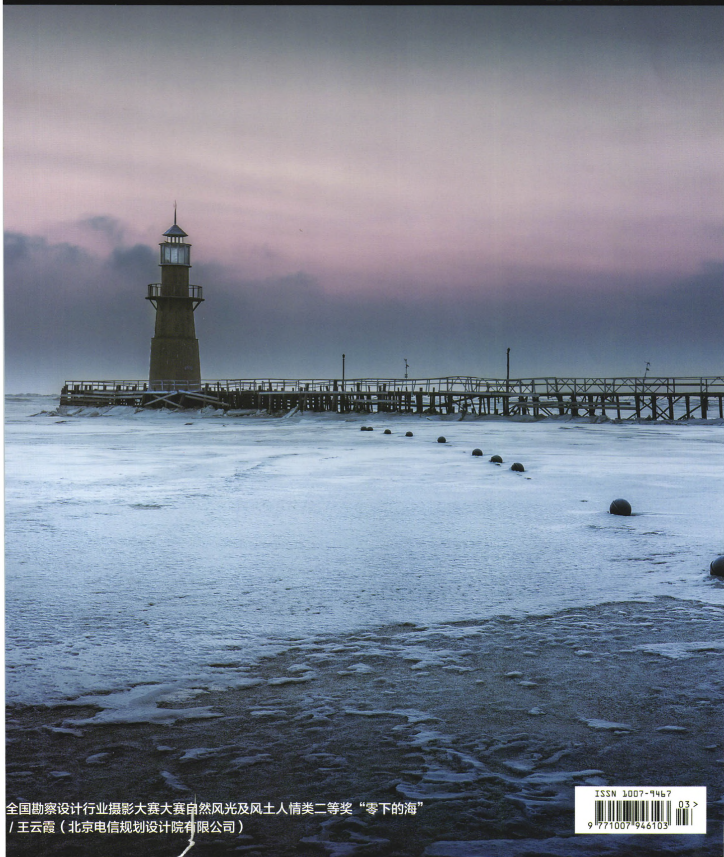
全国勘察设计行业摄影大赛大赛自然风光及风土人情类二等奖“零下的海”

国家机械工业局工程建设中心 中国机械工业勘察设计协会 中国中元国际工程有限公司 CN 11-3914/TU 2016年第03期 总第335期