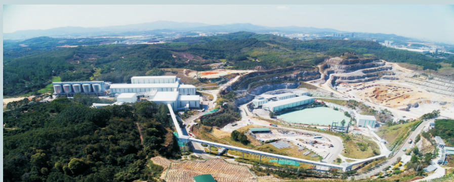
广东顺兴石场有限公司年产480万m 3 建筑用花岗岩扩产露天开采设计