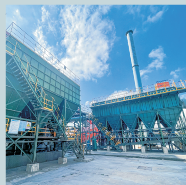
马钢罗河矿除尘改造项目