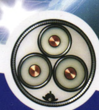
220 kV 3×800 mm 2 光电复合海底电缆

江苏亨通高压海缆有限公司 HENG TONG SUBMARINE POWER CABLE CO., LTD.