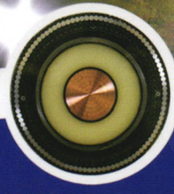
DC525 kV×3 000 mm 2 交联聚乙烯绝缘海缆