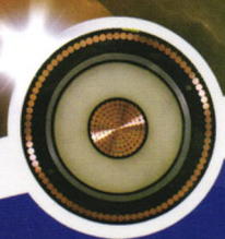
AC500 kV×1 800 mm 2 交联聚乙烯绝缘海缆

TRANSMIT SHINING DREAM SMARTLY CONNECT BETTER LIFE