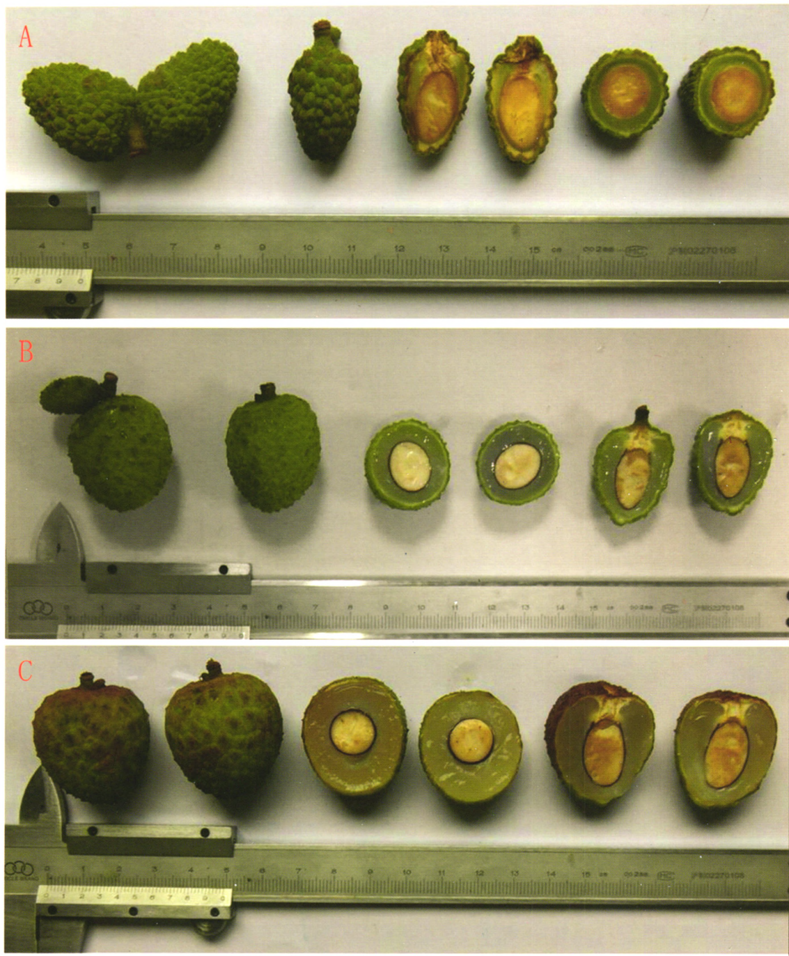
图 版 说 明

WANG Bei et al: Membrane/wall-bound peroxidases in litchi pericarp and their changes during fruit development Plates