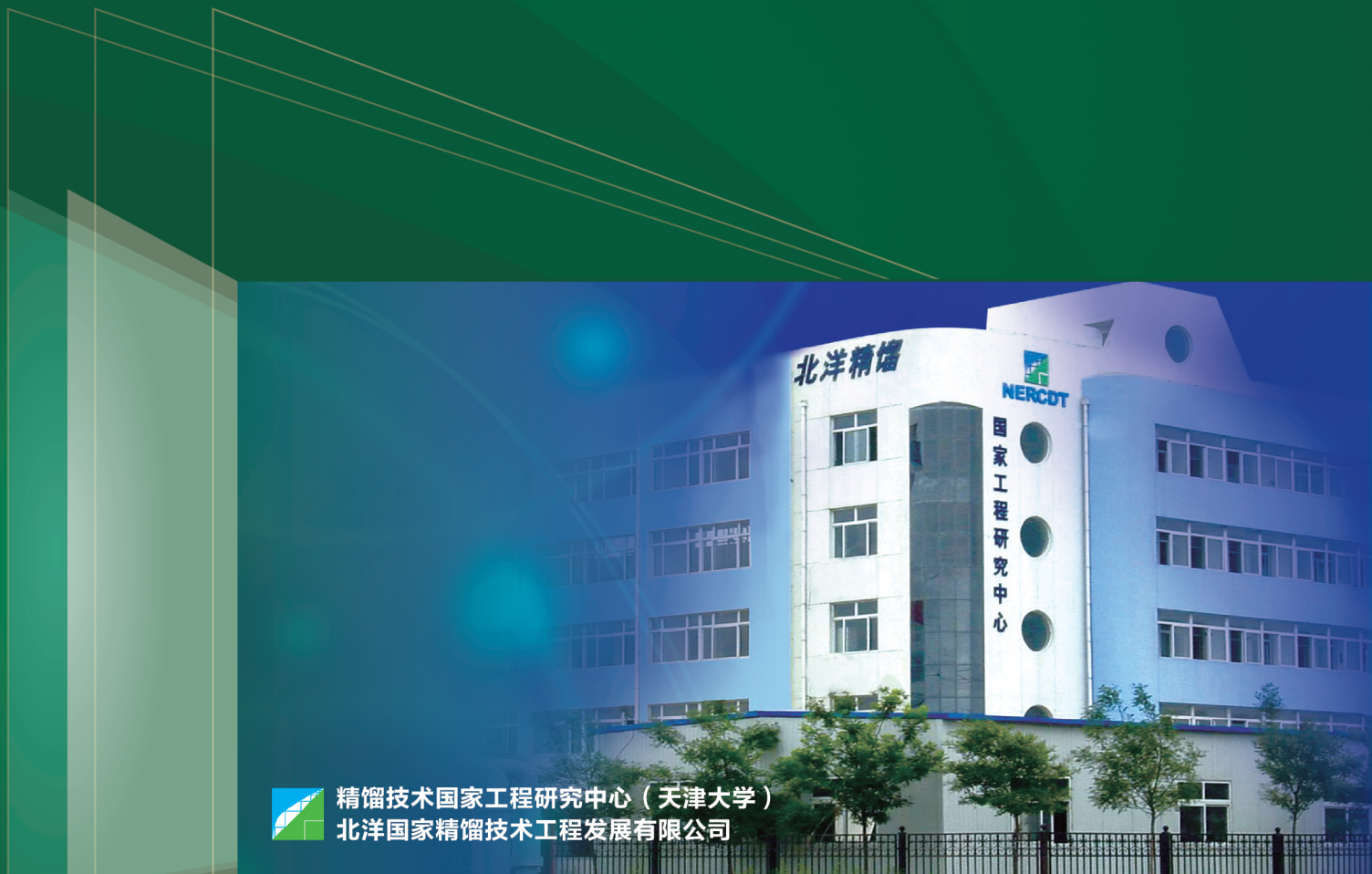
精馏技术国家工程研究中心 (天津大学) 北洋国家精馏技术工程发展有限公司