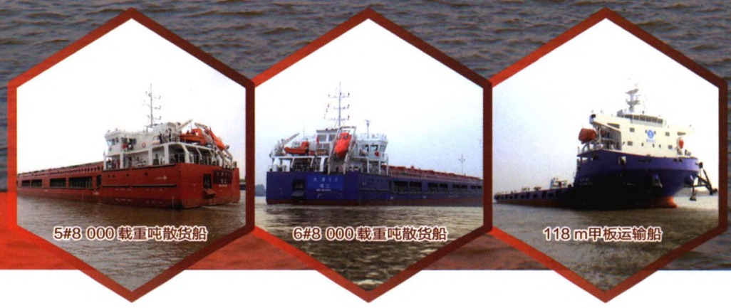
5#8 000 载重吨散货船