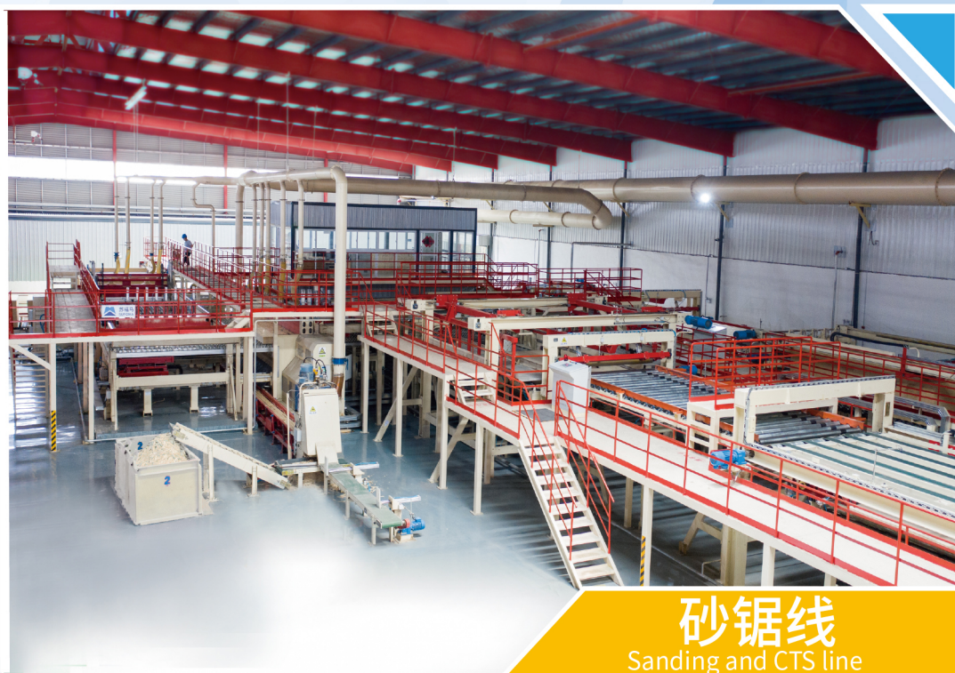
砂锯线 Sanding and CTS line