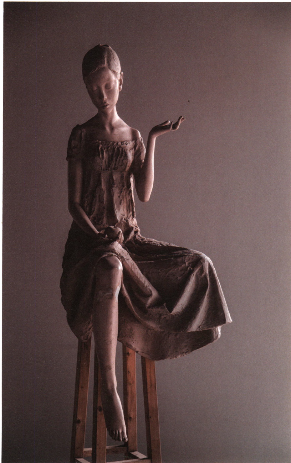
粉色系列之三 玻璃钢着色 153 × 90 × 80cm 2012年