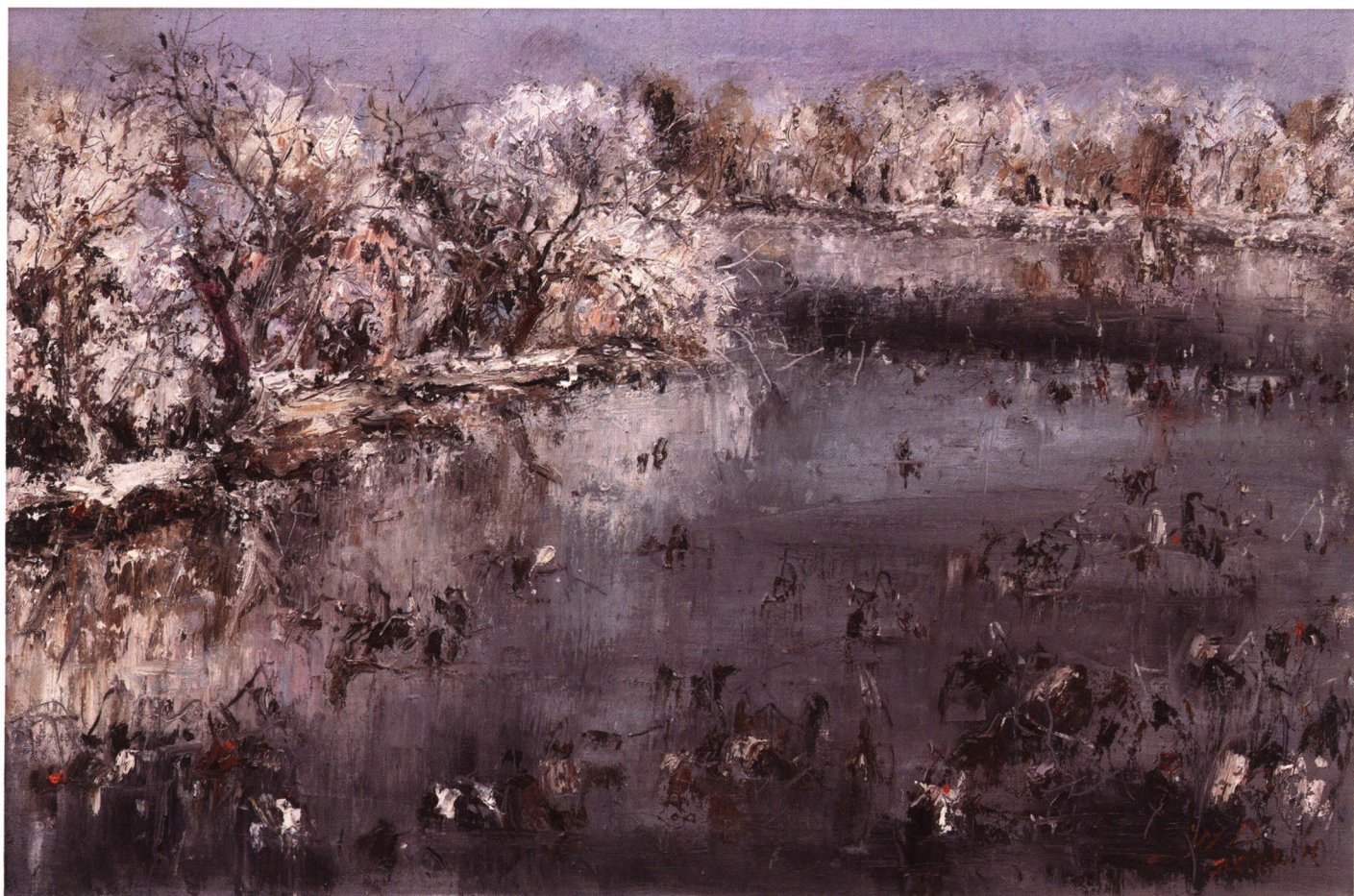
刘伟冬 布面油画 70×50cm 2021年