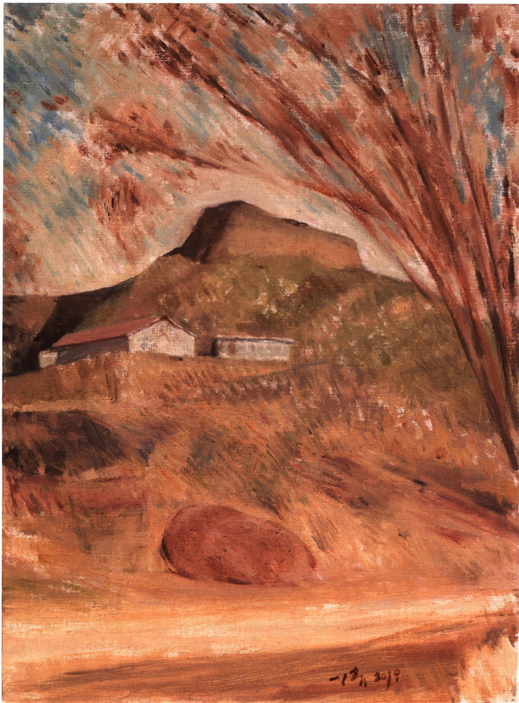
红柳和坡地 布面油画 60x45cm 2019年