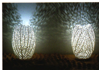
Nervous System实验室设计的Hyphae Lamps