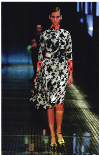
PRADA 17 年走秀款