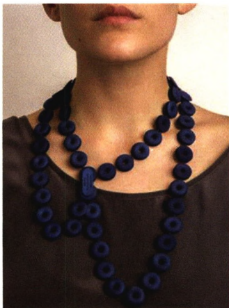
意大利珠宝品牌 Maison 203 推出的 3D 打印 首饰——Kalikon 系列产品