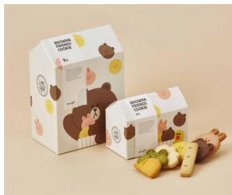
LINE Cafe F&B 品牌饼干设计