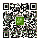
我爱益生元官方微信