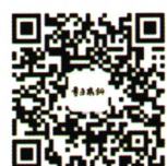
量子高科官方微信

广东广州越秀区东风中路268号交易广场28楼 电话：86-20-83180677 传真：86-20-83304079 邮箱：kf@qht.cc 网址：www.qht.cc