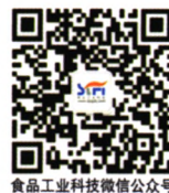
食品工业科技微信公众号