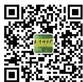
编辑部微信公众号