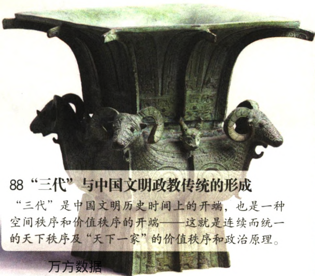
88 “三代”与中国文明政教传统的形成 “三代”是中国文明历史时间上的开端，也是一种空间秩序和价值秩序的开端——这就是连续而统一的天下秩序及“天下一家”的价值秩序和政治原理。