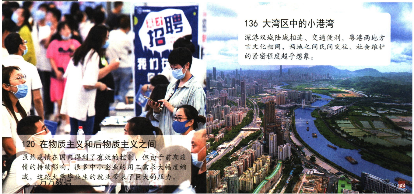
136 大湾区中的小港湾 深港双城陆域相连、交通便利，粤港两地方言文化相同，两地之间民间交往、社会维护的紧密程度超乎想象。