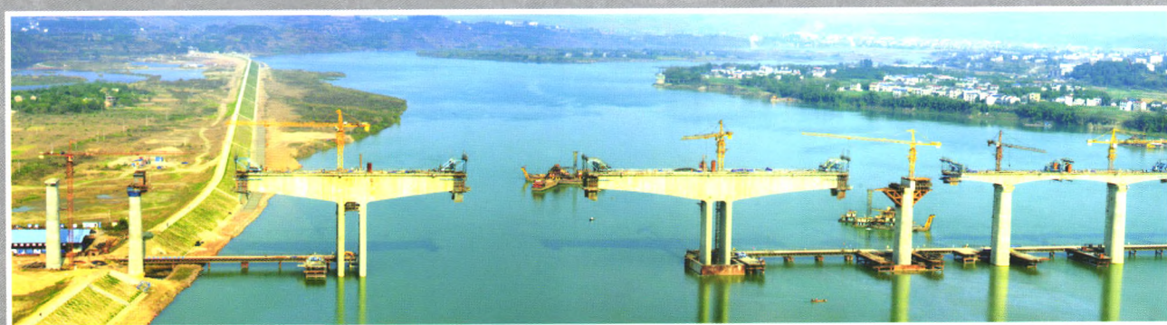
嘉陵江特大桥 160 m 连续刚构施工照片