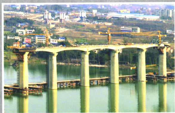
嘉陵江特大桥 60 m 连续刚构