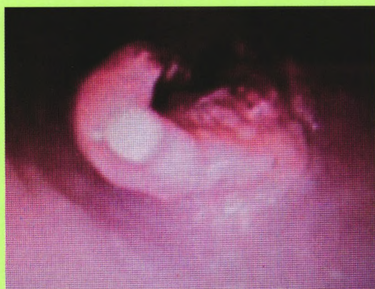
Fig.1 Esophageal stenosis image under endoscopy prior to treatment

第20卷 第4期 2014年4月 Volume 20 Number 4 Apr. 2014