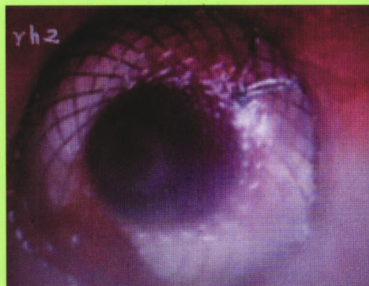
Fig.2 Esophageal stenosis stent implantation image under endoscopy