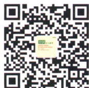
《中国人口科学》微信平台