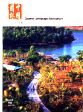
本期封面 深圳聚龙山隧道