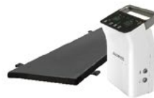
SUN 5 医用升温毯

北京谊安医疗系统股份有限公司 谊安国内客户服务专线电话 400 610 8333 / 800 810 8333