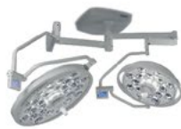
Pureit® OL9500 系列LED手术无影灯