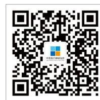
官方微信公众平台

期刊基本参数: CN11-3700/R*1995*s*16*192*zh*p*18.00*50000*24*2020-23