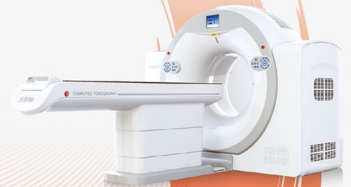
X射线计算机体层摄影设备 XHCT-16 注册证编号：国械注准20183060511