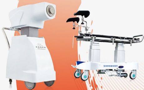
γ射线遥控后装治疗机 XHDR30 注册证编号：国械注准20183051888