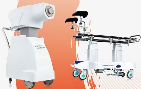
γ射线遥控后装治疗机 XHDR30 注册证编号：国械注准20183051888