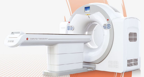
X射线计算机体层摄影设备 XHCT-16 注册证编号：国械注准20183060511