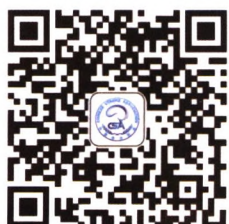
中国卒中学会官方微信

组委会将组织专家评审团对所有来稿进行审核，评选出的优秀论文作者将登上学术舞台，在大会论坛进行口头发言，或在壁报展示区与同道及专家展开面对面交流。优胜者将获得大会颁发的荣誉证书及奖品。